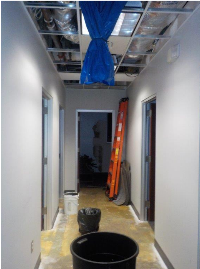
Wilmington International Airport